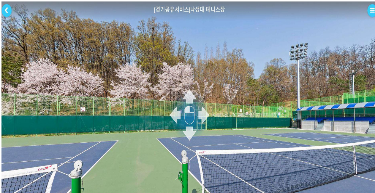
360° VR Panoramic image (Naksaengdae Tennis Court)