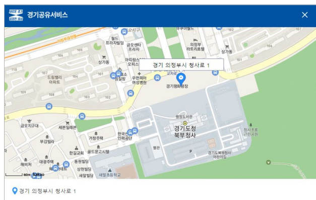
Longitude/latitude can be modified