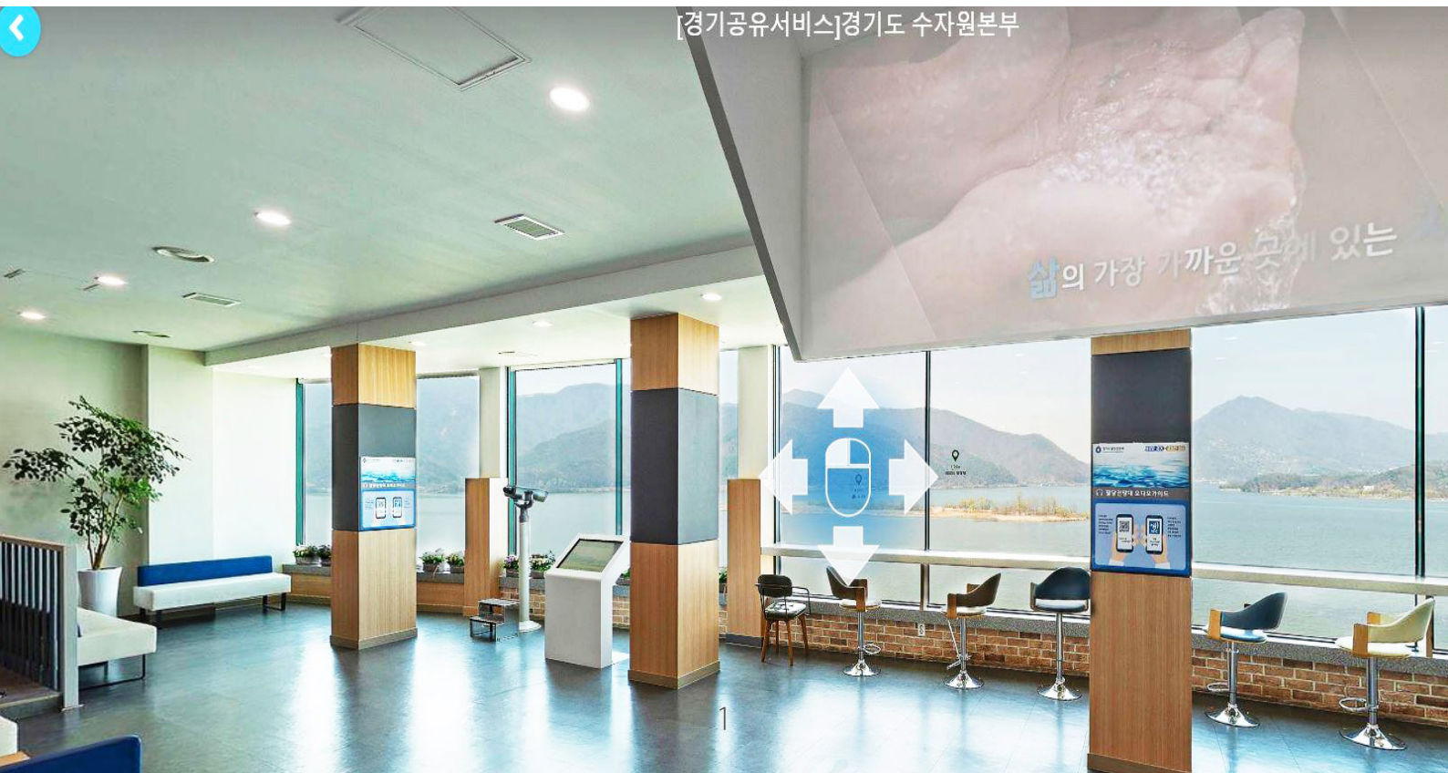
360°VR Panoramic image (Paldang Observatory)

Facility managers can designate and modify the facilities' longitude and latitude, allowing visitors to easily locate facilities.